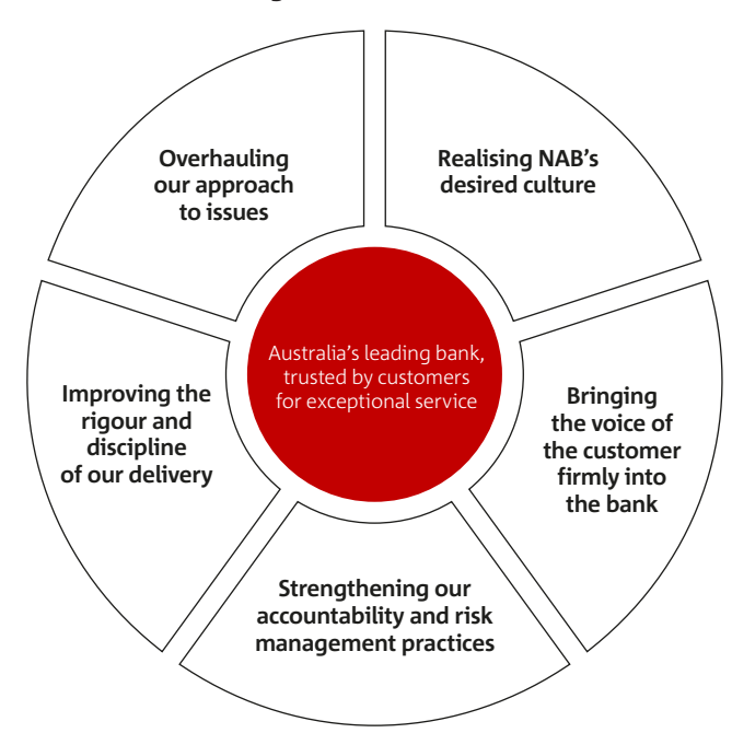
Figure 10.1 NAB's goals in responding to self-assessment findings

ELT leads have been allocated to each area and will have accountability for the delivery of the actions outlined.