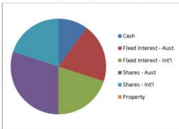
Asset Allocation (excluding Direct Property)